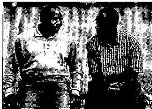
The real Paul Rusesabagina with Don Cheadle, the actor who played him in Hotel Rwanda .

Hotel Rwanda is based on real characters and events that happened in Rwanda in 1994. It focuses on the efforts of Paul Rusesabagina, a hotel manager, to hide hundreds of Tutsi refugees from the Interahamwe militia.